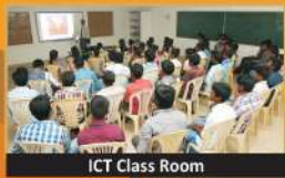
ICT Class Room